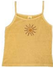
Ladies Sunburst Tank Top , by Earth Creations, 55% Hemp, 45% organic cotton, clay dyed maize color, Sizes: S, M, L, $25