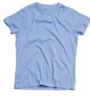
Women's 100% Organic T-shirts by Econscious, Women's fit Color Caribbean, Size: Medium White, Sizes: S, M, L, $12