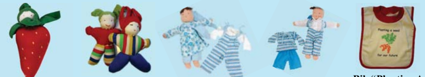
Strawberry $6 Doll Set $15 Jill Doll 14" $40 Jack Doll 14" $40 Bib "Planting A Seed For Our Future", $9