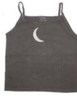
Sale Ladies Crescent Moon Tank Top , by Earth Creations, 55% Hemp, 45% organic cotton, clay dyed Charcoal, Sizes: S, M, L, $24-$21