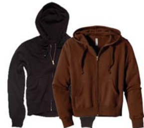
Fleece Zip Hoodie By Econscious, Women's fit, 80% organic cotton, 20% polyester, Earth Size M, $36 Black Size L $36