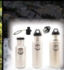
Klean Kanteen: Personal water bottles, reusable, lightweight, non-leaching & toxin-free, stainless steel bottles, comes with a sports cap, stainless loop cap sold separately.