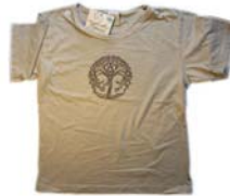
Tree Pose T-shirt , by Earth Creations 100% organic cotton, clay dyed ash color, Sizes: S, M, L, $21