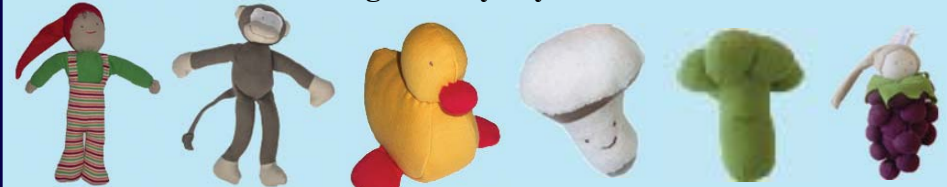
Baby Elf Doll $14 Monkey $16 Duck $8 Mushroom $6 Broccoli $6 Grapes $6