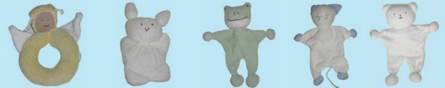
Bumble Bee Ring $8 Bunny $10 Frog $11 Kitty $11 Teddy Bear $10