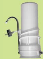
Single Stage Water Filter for the counter-top, fits on faucet, easy to use, fast flow $49