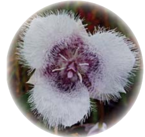
Calochortus tolmiei, also known as Pussy Ears, Siskiyou Wild Rivers.

Jane's Nursing Bra Top , by Blue Canoe, 100% organic cotton. Easy access for nursing. Natural Sizes: S, M, L, XL $32- $26, Plus Size L: $34 $28 * While supplies last