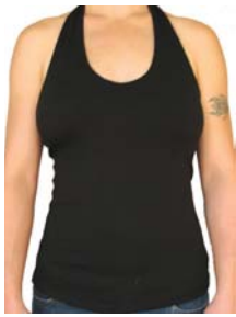
Sale Sheer Halter Top by Blue Canoe, Ultra soft 90% organic pima cotton sheer, 10% lycra, Black, S, M, L, $42 Sale Brick L , $38, $30.50 while they last