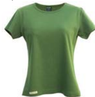
Altai Women's T-shirt , by Hae Now, 100% organic, Forest Green, Sizes: S, M, L, XL, $15