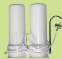
Double Stage Water Filter for the counter-top, combine two filters for ultimate relief $74