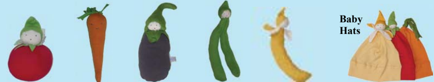
Tomato $6 Carrot $6 Eggplant $6 Green Bean $6 Banana $6 Banana, Tomato, Carrot $9