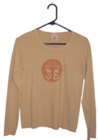
Tree Pose Long Sleeve , by Earth Creations 100% organic cotton, clay dyed citrine color, Sizes S, M, L $28