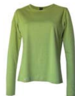
Acadia Women's Long Sleeve , by Hae Now, 100% organic, Sage Green, Sizes: S, M, L, XL, $18