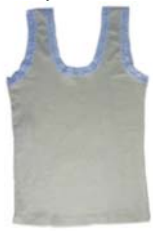
Lace Rib Tank Top , by Blue Canoe, 100% organic cotton, feminine lace trim, Color Natural, Sizes: S, M, L, $34