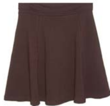
Ladies Squirt by Blue Canoe, Skirt + Shirt = Squirt Versatile top or skirt 90/10 organic cotton/lycra, Cocoa Colored. Sizes S, M, L $46