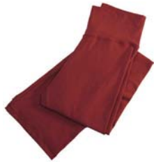
Sale Yoga Pants by Blue Canoe, 100% organic cotton. Black, S, M, L $56 Sale Brick , XS, L $56, $45 while they last