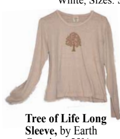
Tree of Life Long Sleeve , by Earth Creations 55% Hemp, 45% organic cotton, clay dyed ash color, Sizes: S, M, L, XL, $37