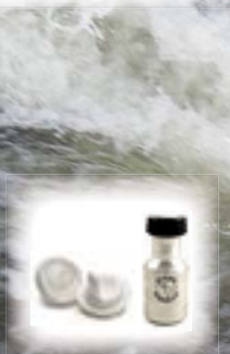
Klean Kanteen Sippy Cup A lightweight and risk-free 12oz stainless steel bottle for babies. Comes with a sippy adapter made from safe, non-leaching polypropylene (pp#5) and 2 sippy $17.50spouts. $17.50