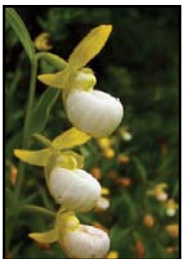
California Ladys-slipper of the Siskiyou Wild Rivers area.