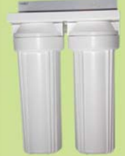
This Double Stage Filter screws in below the counter to the cold water line. Combine two filters for ultimate protection $53