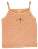
Ladies Dragon Fly Tank Top , by Earth Creations, 5% Hemp, 45% organic cotton, clay dyed sunstone color, Sizes: S, M, L, $25